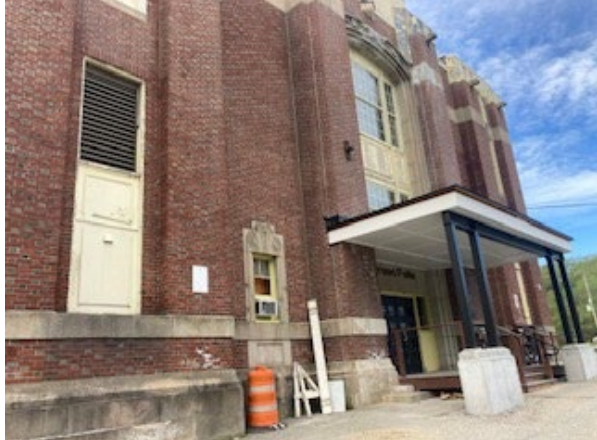
A – Side (Academy Street)