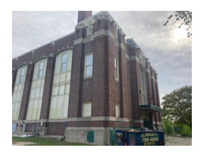
C - Side