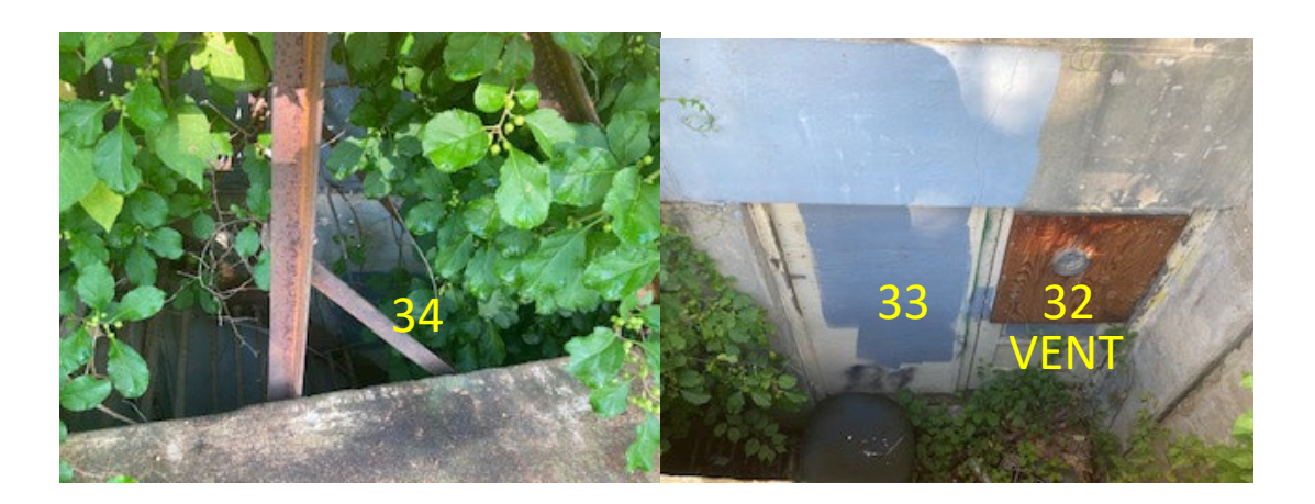
Exterior View B – Side Door / Window Replacement wood Covering